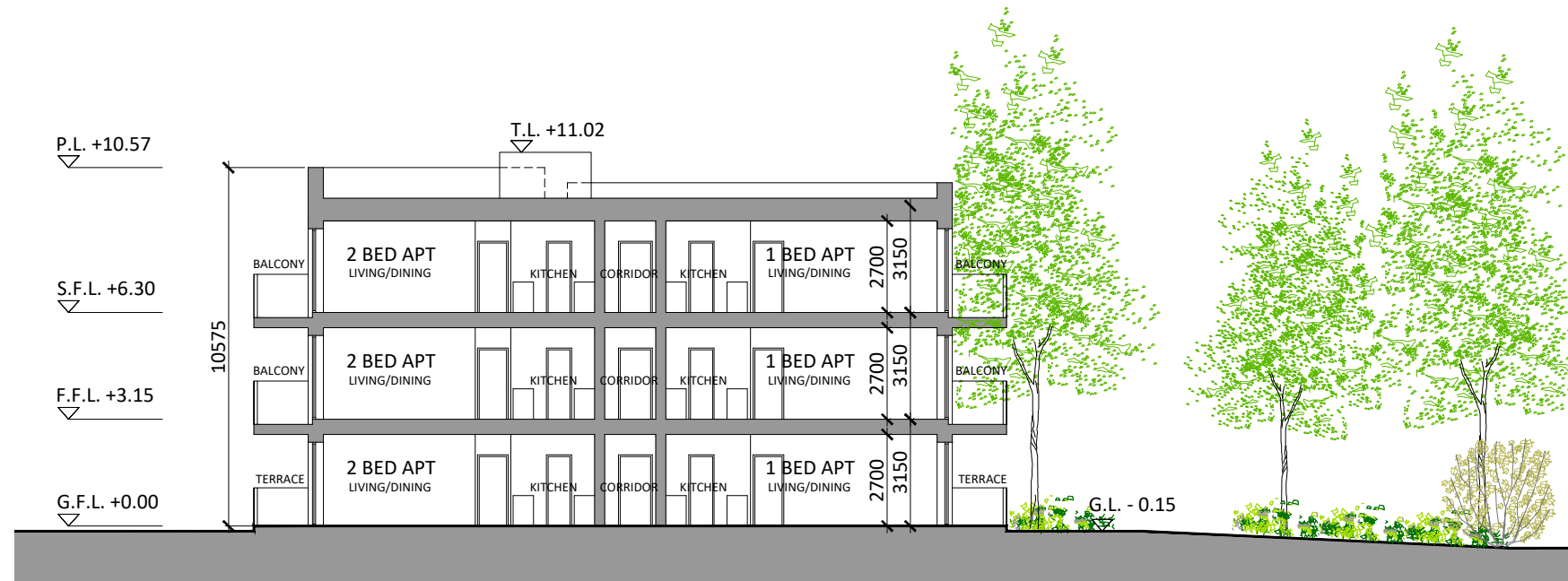
Section A-A scale 1:200