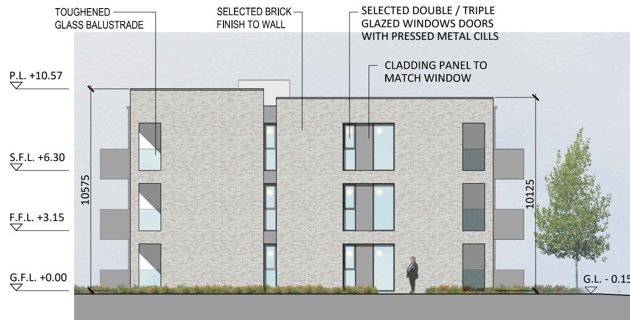
Block D - Gable 1 Elevation scale 1:200